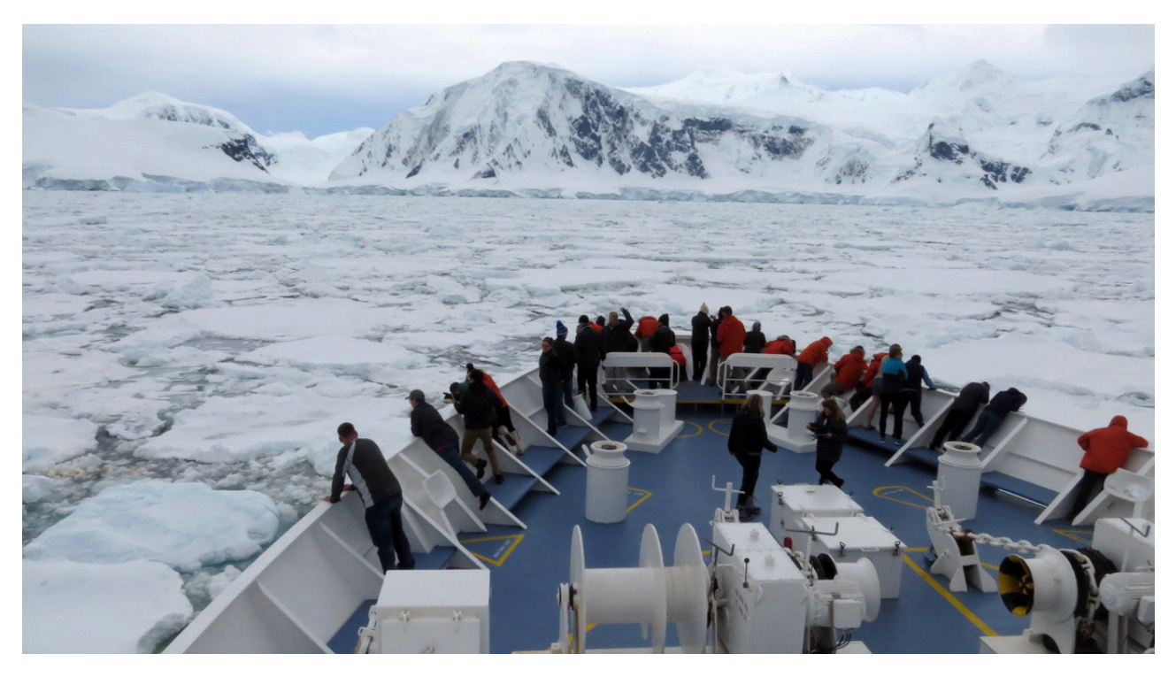
Some, but not all, Antarctic tour ships have hulls strengthened to allow them to push through pack ice. This photo shows a strengthened ship pushing through dense ice conditions early in the summer (November) before most of the sea ice has dispersed.

prohibited from sites deemed of high value for scientific research or set aside to preserve aesthetic values. "Zoning" areas for different activities presents fewer administrative difficulties than a cap and/or quota system. Zoning could also be managed under the existing framework of Antarctic Specially Managed Areas (ASMA) by creating management plans for sites that set limits to activities in these areas. The Scientific Committee on Antarctic Research (SCAR), in conjunction with IAATO, is currently conducting a systematic conservation planning exercise to help identify the sites best suited for particular activities (https://www.scar.org/ policy/scar-iaato-scp/).