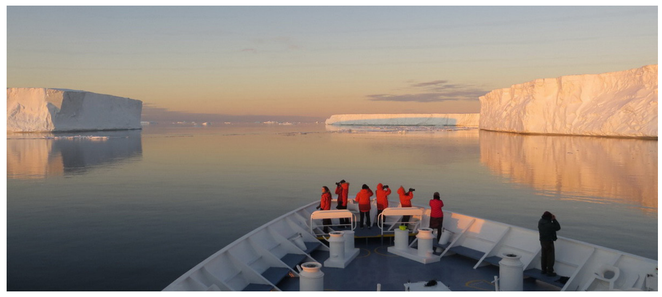
You don't have to leave the ship to enjoy stunning scenery. Visitors on "cruise-only" voyages, which do not make landings, represent about 25 percent of all tourists.

All activities undertaken in Antarctica by signatory parties require a permit. As part of their permit application, tour operators must complete an environmental evaluation that shows their activities can be managed safely and with no more than a minor or transitory impact. External to that, studies have been made of environmental impacts in some localised areas, including some of the sites frequently visited by tourists. Most attention has been paid to impacts on penguins and while many studies have found an absence of negative impact from visitors (e.g., Cobley and Shears 1999, Lynch et al. 2019), a broad meta-analysis of penguin-disturbance studies in Antarctica and subantarctic islands showed a small negative impact (Coetzee and Chown 2016). For impacts on soil invertebrates and other species of wildlife, there is less information, although the populations of some seabird species (including penguins) have been monitored at many sites for over twenty-five years (Lynch et al. 2008, Naveen and Lynch 2011). Noticeably lacking are studies that have quantified cumulative impacts, and impacts on aesthetic and wilderness values.