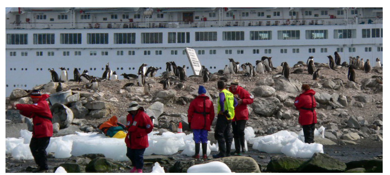
The telephoto lens makes this ship look like it's parked on the beach when in fact it is a safe distance offshore. Ships carrying less than 500 passengers are permitted to make landings in Antarctica. The green vest identifies a staff member who plays an important role in interpretation as well as crowd control.

For the most part, the ATS is happy to let IAATO self-manage their own activities, and IAATO is delighted to have so much say in their own destiny. This is a highly unusual arrangement: seldom do the companies profiting from a common-pool resource, get to dictate how they consume that resource. However, as tourist numbers grow and are perceived to put greater pressure on the Antarctic environment, this arrangement will be tested.