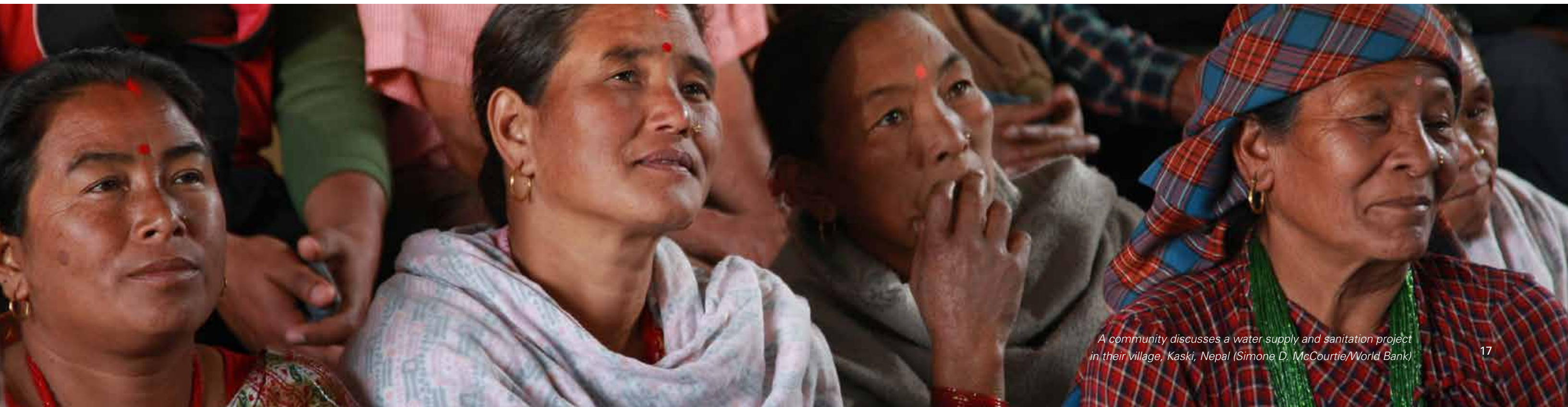
A community discusses a water supply and sanitation project in their village, Kaski, Nepal