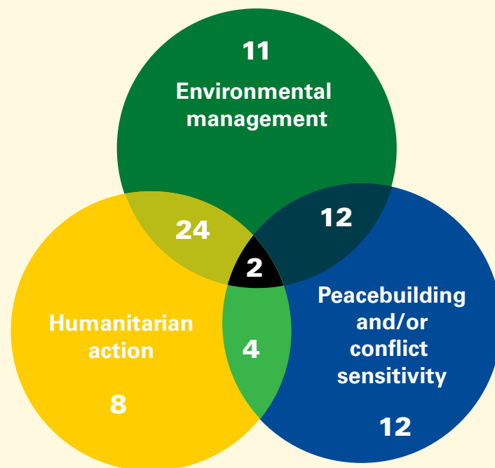
Figure 2: Relevant toolkits identified, by areas of focus

Source: Compiled by the authors from the Environmental Dimensions of Sustainable Recovery database, available at http://edspace.american.edu/greentools/