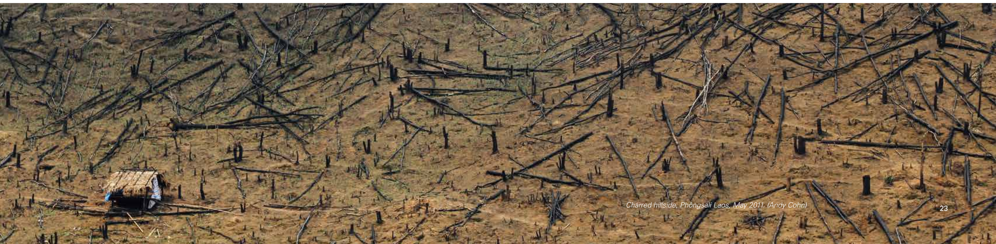
Charred hillside, Phongsali Laos, May 2011.

This depth-versus-breadth debate parallels the longstanding discussion in the increasingly institutionalized post-conflict and post-disaster “needs assessment” process about how to integrate environmental considerations. A key coordination mechanism in humanitarian work is the “Cluster Approach” system, in which groups of organizations (UN-based, NGOs, and others) form a cluster that coordinates efforts in 11 key aid sectors, such as health, housing, food, or water and sanitation (UNOCHA n.d.). The environment is considered a “cross-cutting” issue (like age, gender, HIV/AIDS, and others). Without an individual who has