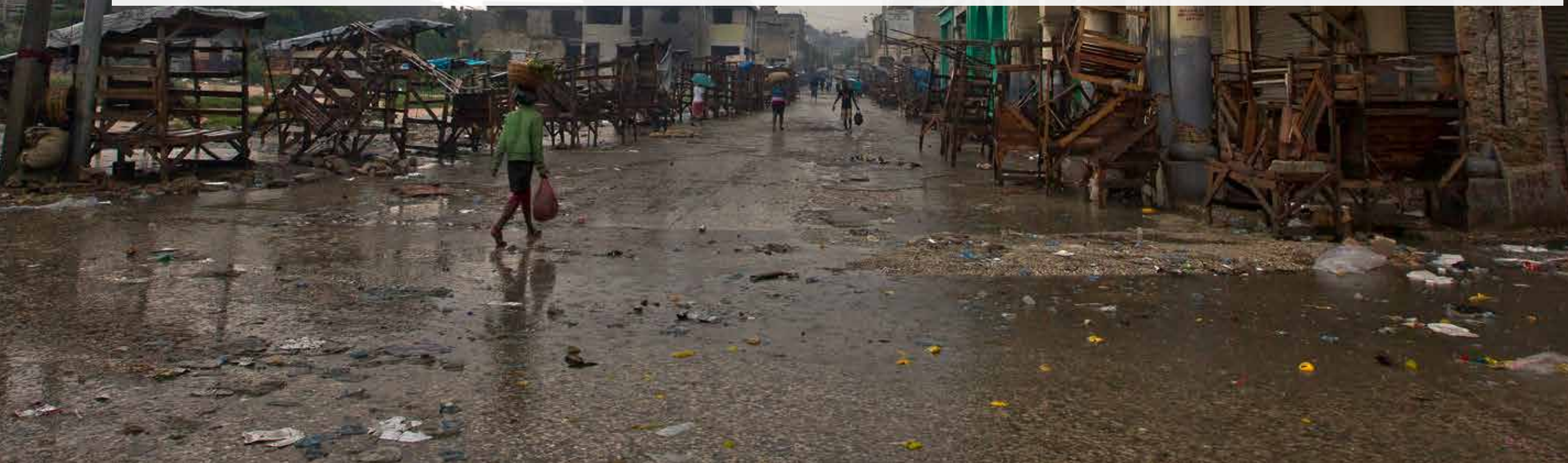
A woman walks through deserted downtown Port au Prince, Haiti, following Hurricane Sandy, October 2012

“A report from USAID's Office of the Inspector General found a failure to adequately monitor environmental mitigation plans related to new housing construction.”