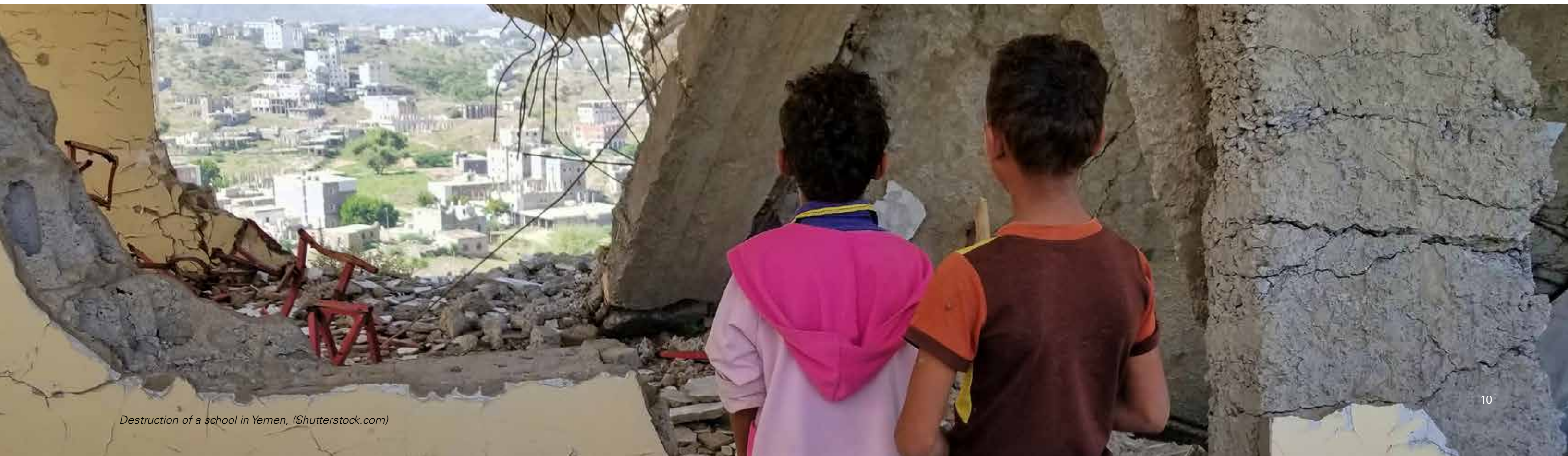
Destruction of a school in Yemen, (Shutterstock.com)

The United States is certainly not alone in struggling with these challenges. The UK’s Independent Commission for Aid Impact has flagged the difficulties facing UK aid to Afghanistan, stressing the need for evidence-based interventions and closer consultation with beneficiaries (ICAI 2014). Other bilateral aid agencies have struggled with “mainstreaming” environmental considerations into their work, including failures to assess environmental performance of aid operations and to mainstream environmental considerations into aid operations (Brunnström et al. 2006, Kelly 2013). Nor are donors the only international actors facing such challenges: private-sector firms face challenges of combining effective environmental analysis with conflict-sensitive approaches to infrastructure projects, particularly in fragile states (see Box 2).