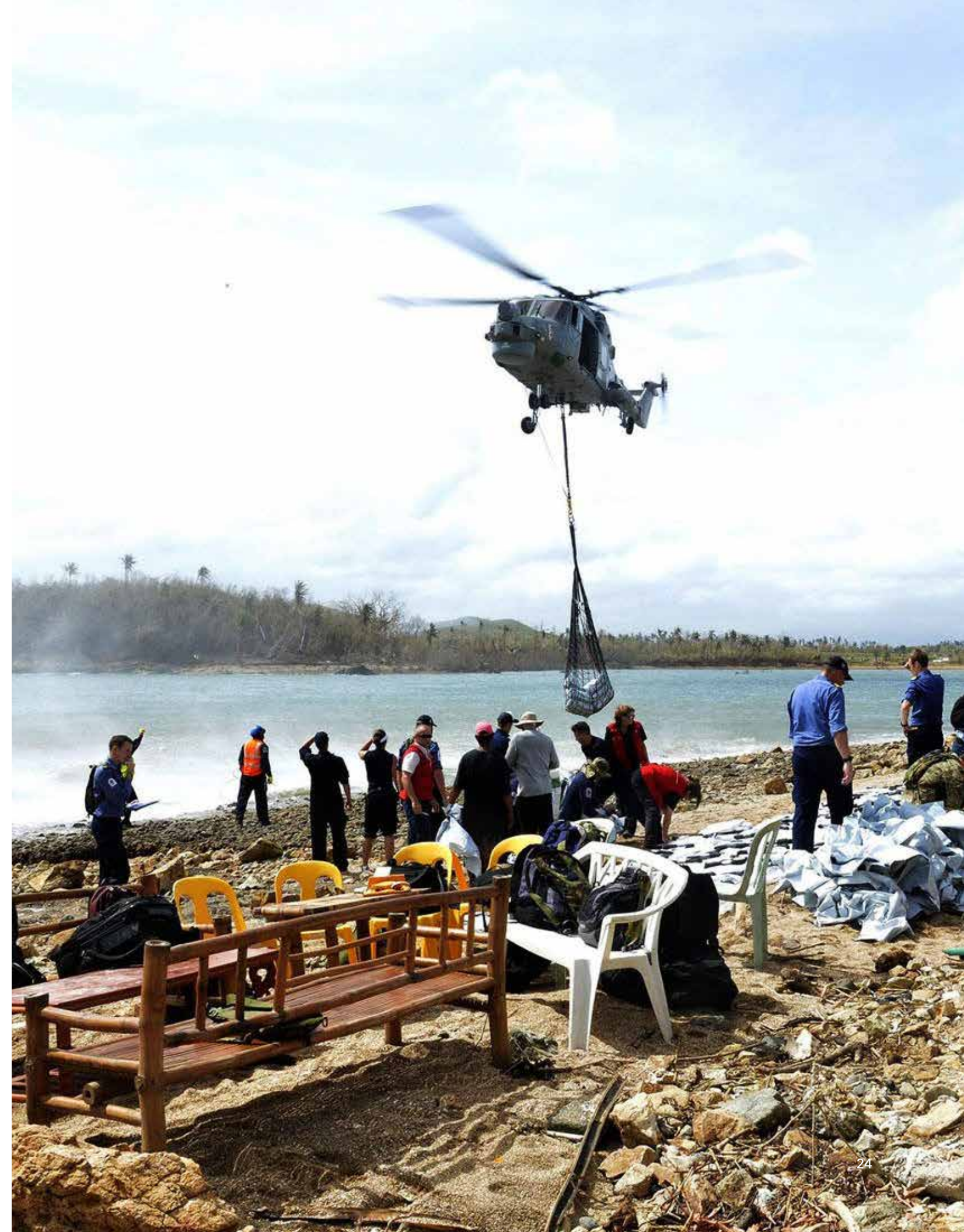
Right: Royal Navy Lynx Helicopter brings Aid to the Philippines following Typhoon Haiyan, November 2013.