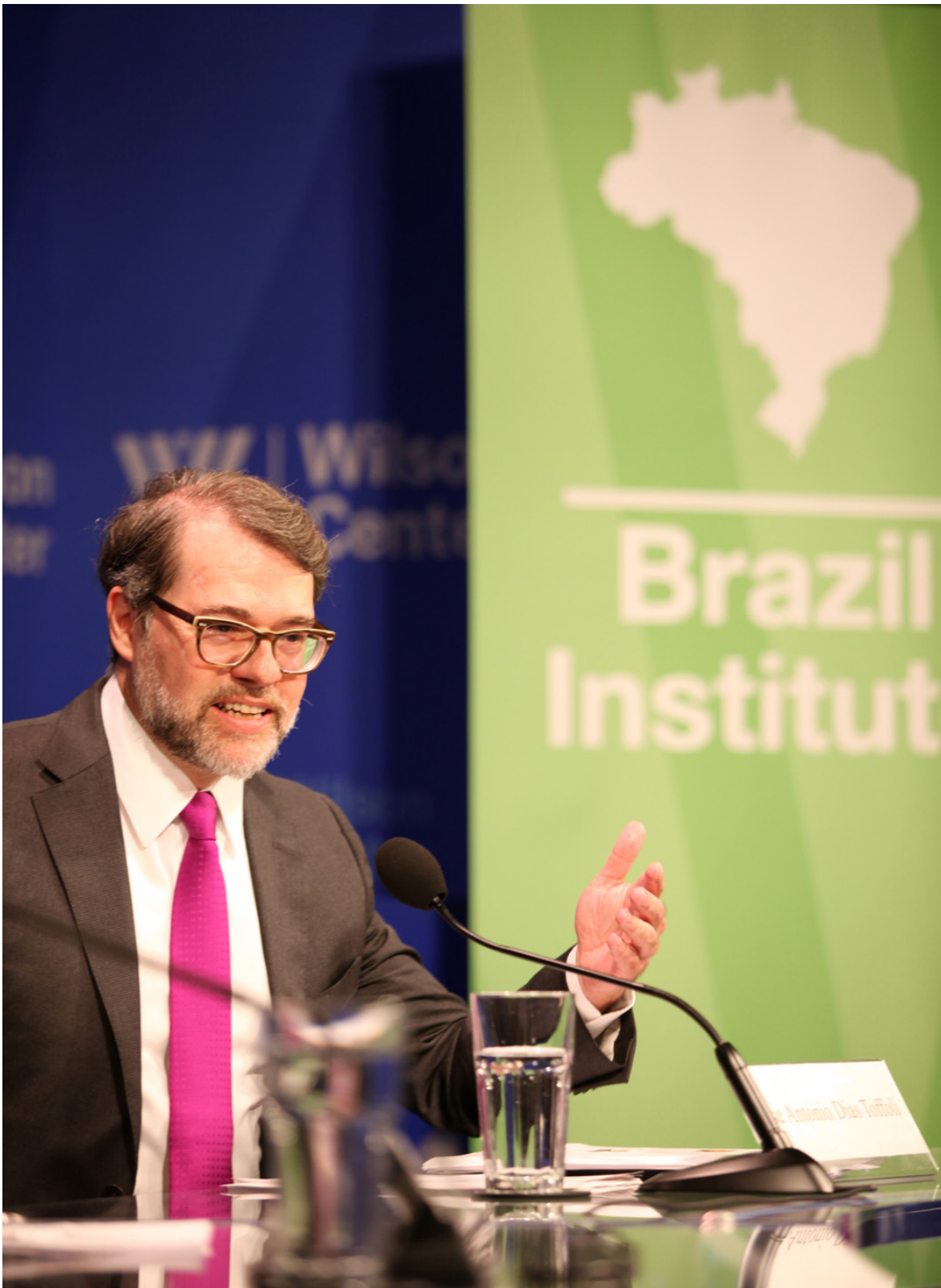
Justice José Antonio Dias Toffoli at the Brazil Institute (July 6, 2016)