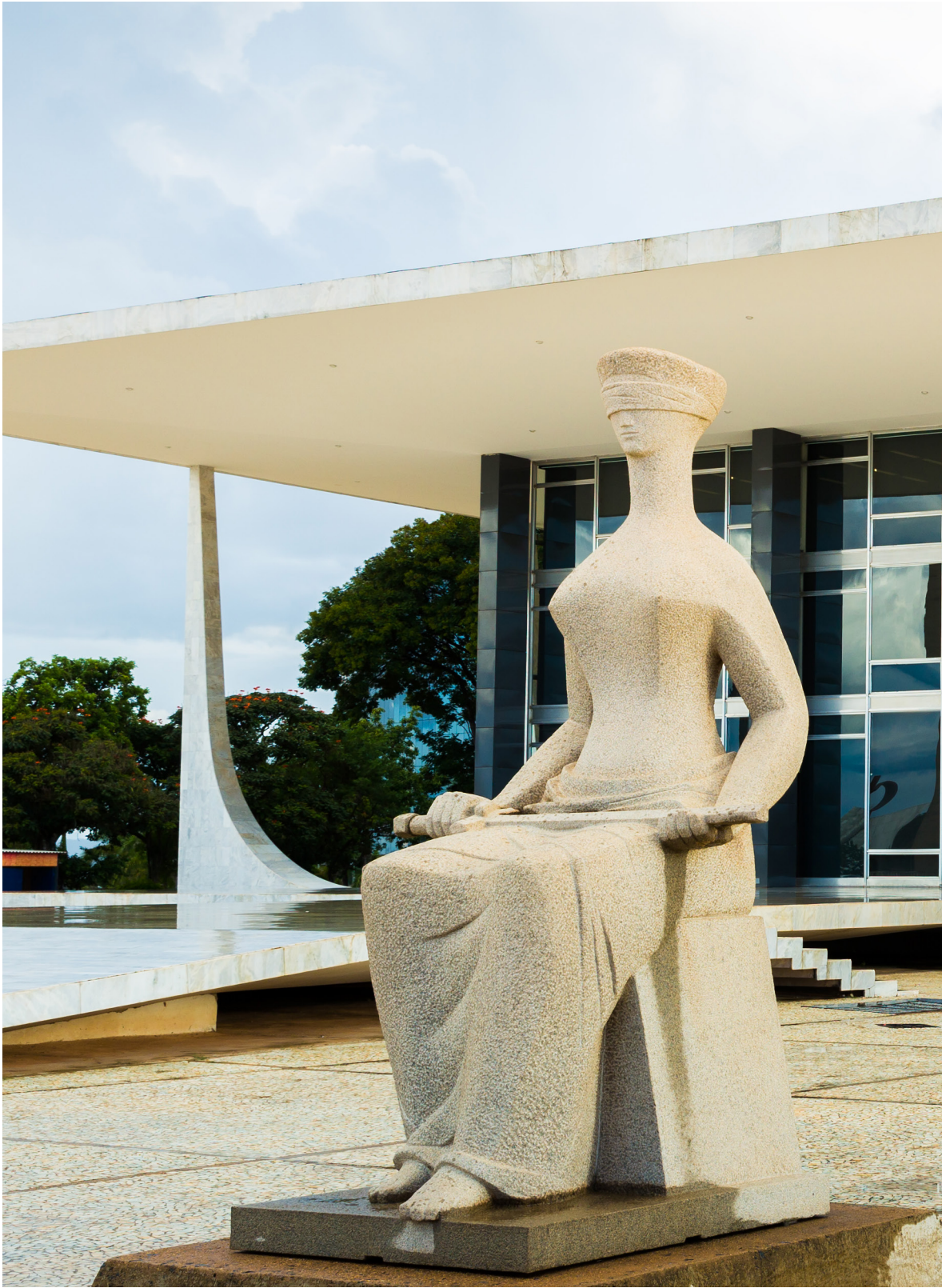
Justica (Justice) by Alfredo Ceschiatti, outside the Palace of the Supreme Court in Brasília