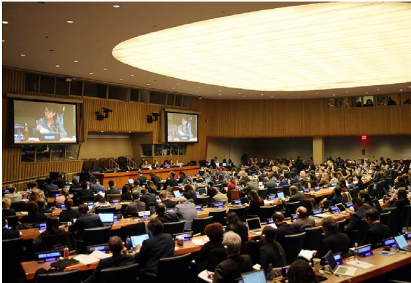
Views from IGC 2