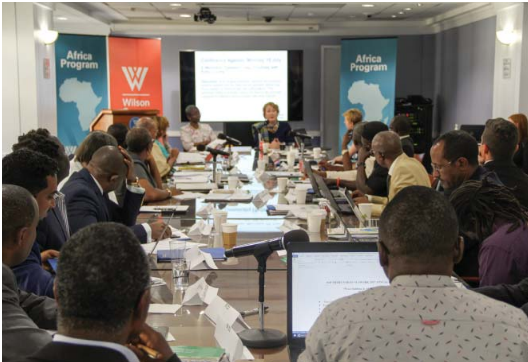
Pictured Here: SVNP Conference Participants