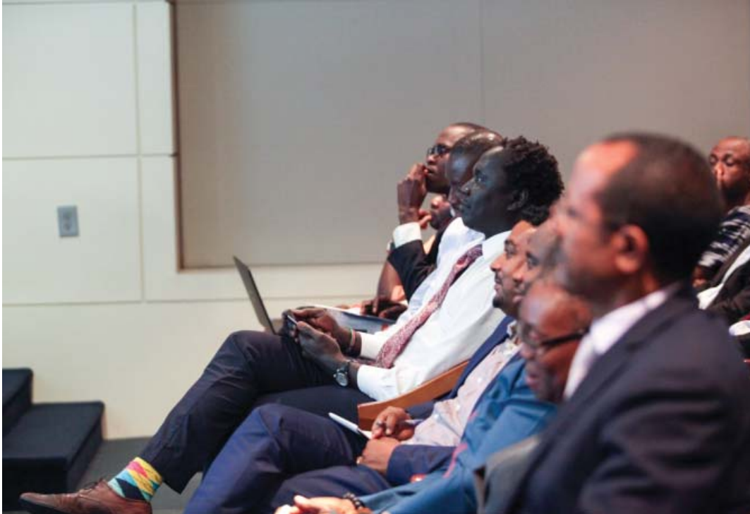
Pictured Here: Members of the audience