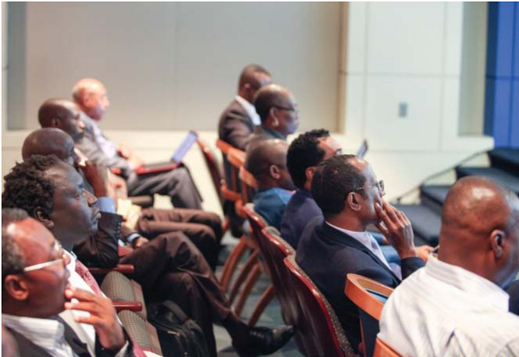
Pictured Here: Members of the audience