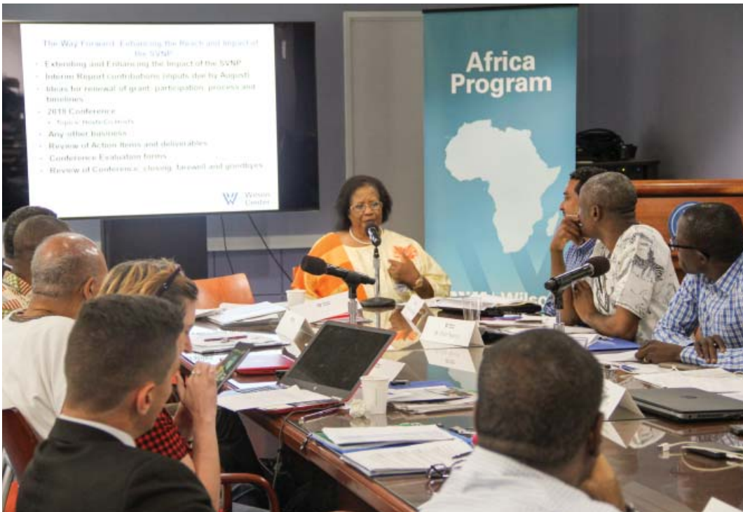
Pictured Here: Dr. Joyce Banda, Former President of Malawi, and Distinguished Fellow at the Woodrow Wilson Center (USA)