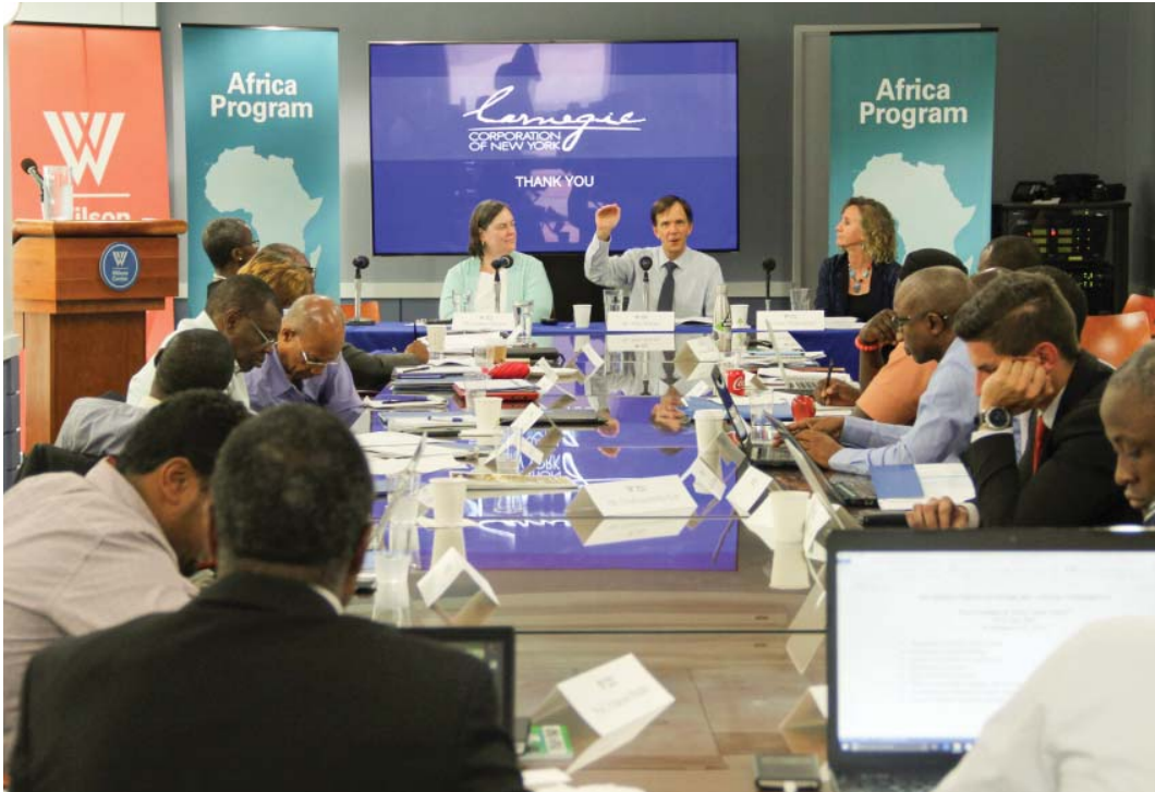
Pictured Here: SVNP Conference Participants