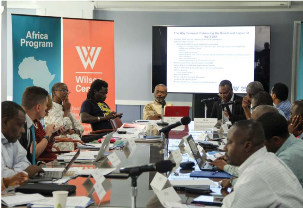
Pictured Here: SVNP Conference Participants