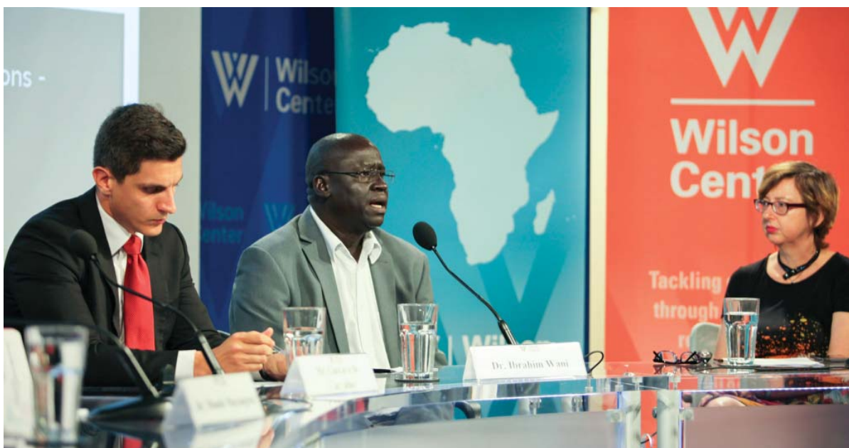
Conference panelists discuss the efficacy of Africa's peacebuilding institutions, and provide recommendations for improving peacebuilding architectures.