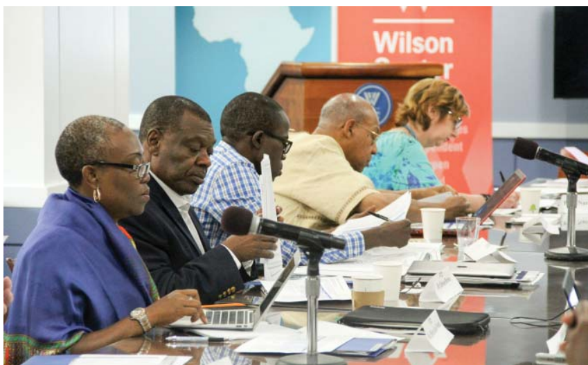
SVNP representatives discuss their organization's missions and collaboration efforts.