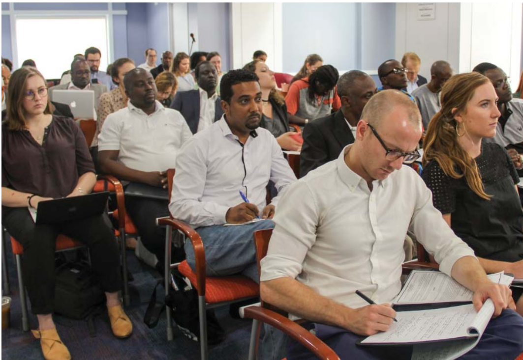
Pictured Here: Members of the audience