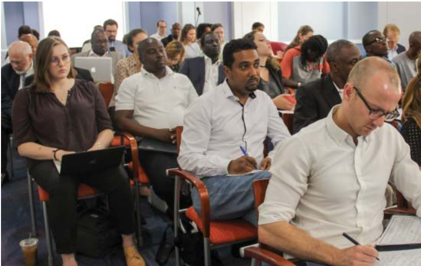
Audience members engage in a conversation regarding post-conflict peacebuilding and examine many intersectional factors that influence it.