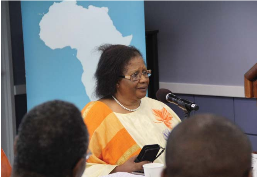
Pictured Here: Dr. Joyce Banda, Former President of Malawi, and Distinguished Fellow at the Woodrow Wilson Center (USA)