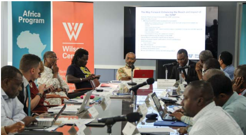
SVNP members engage in a roundtable discussion on their individual experiences in the scholarship, highlighting how the SVNP has aided them and their organization.

The complete list of deliverables and action items can be found in the appendices.