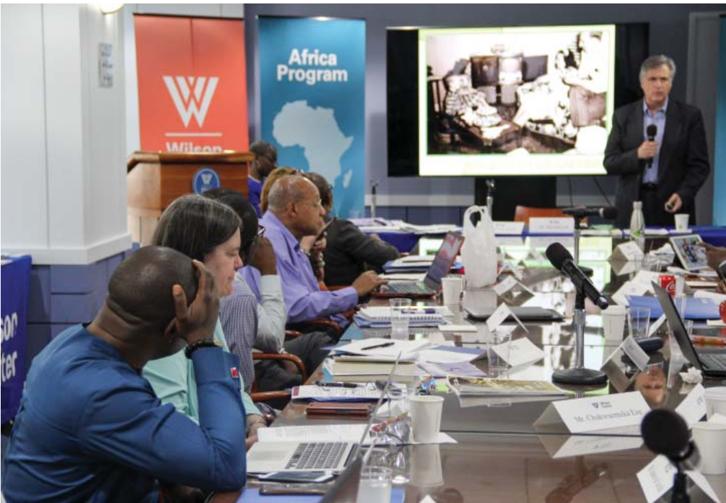
Pictured Here: SVNP Conference Participants